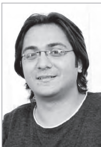
Baccalaureate Degree Programs

The chart relevant to your degree program shows a graphic representation of the credit needed to fulfill all the requirements for your chosen degree.