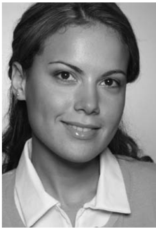
Baccalaureate Degree Programs

The Bachelor of Science in Health Sciences degree program is designed to meet the educational needs of health care workers seeking a bachelor's degree. This program affords students an opportunity to apply credits already earned toward an associate or bachelor's degree to acquire a credential needed for graduate school admission, promotion, job expansion, and job mobility. The curriculum will not only provide students with a broad background in health, the health care system, and the arts and sciences, it will also give them an opportunity to develop knowledge and skills in one of the four areas of emphasis—management, health education, gerontology, or end of life care.