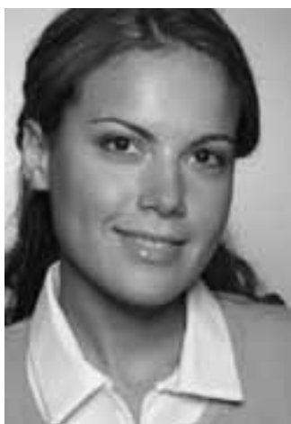
Baccalaureate Degree Programs

The Bachelor of Science in Health Sciences degree program is designed to meet the educational needs of health care workers seeking a bachelor's degree. This program affords students an opportunity to apply credits already earned toward an associate or bachelor's degree to acquire a credential needed for graduate school admission, promotion, job expansion, and job mobility. The curriculum will not only provide students with a broad background in health, the health care system, and the arts and sciences, it will also give them an opportunity to develop knowledge and skills in one of the four areas of emphasis—management, health education, gerontology, or end of life care.