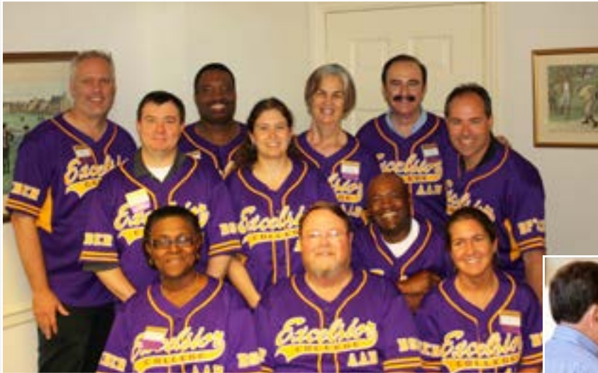
Alumni Advisory Board members at a board meeting in Albany, NY.