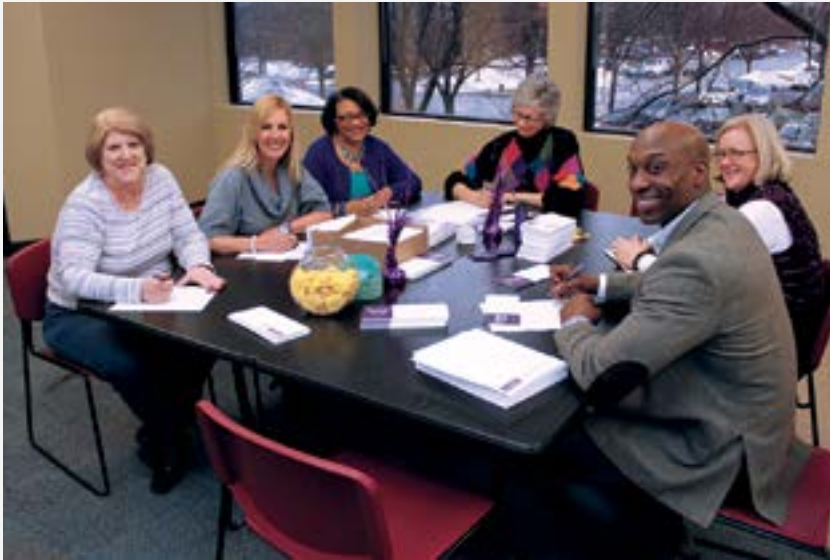
Staff alumni write thank you notes to Annual Alumni Campaign donors.